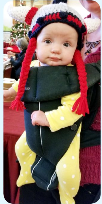
A little Viking enjoyed the October Bazaar!